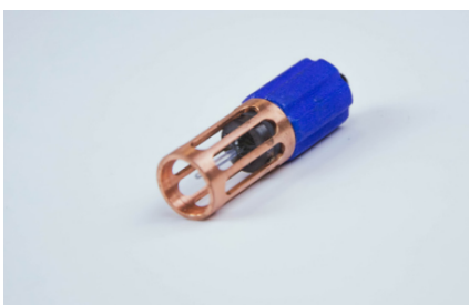
Exchangeable sensor head