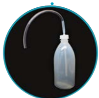
Plastic bottle for sensor cleaning