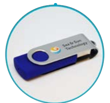
Software and documents