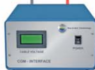
Interface Power supply: 9 to 36 VDC or 230 VAC