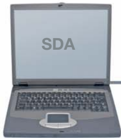
Computer for data acquisition